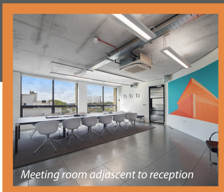
Meeting room adjacent to reception