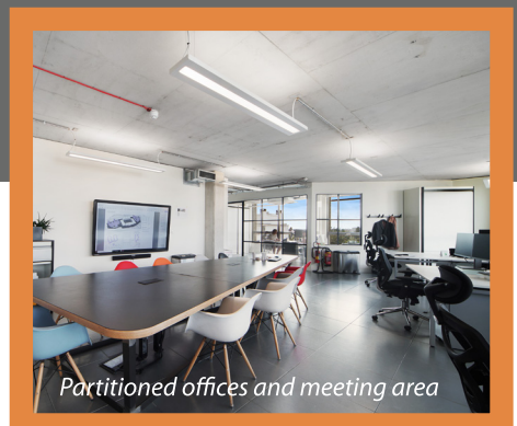
Partitioned offices and meeting area